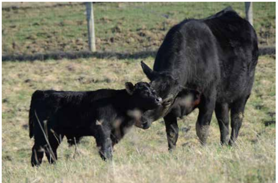
Cows display complex emotions and personalities.

Even though they were domesticated for human use in the early Neolithic period (as early as 10,500 B.C.), domestic cows still demonstrate a range of sensory capacities passed down from their wild auroch ancestors. Animals' sensory capacities determine the kind of basic information they can use