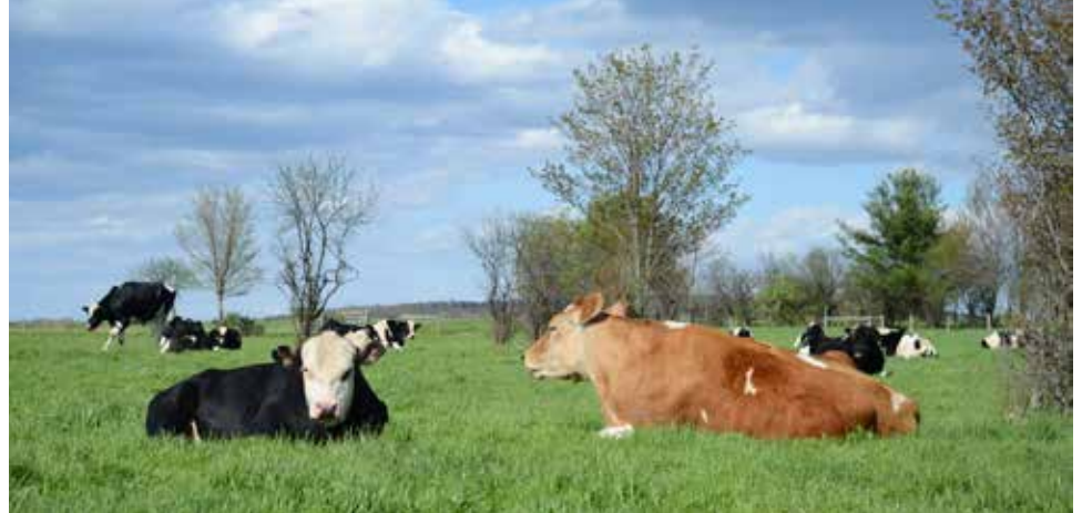
Steers Frank and Blitzen in the cow pasture.

Numerous studies reveal that cows depend on each other extensively for emotional support.