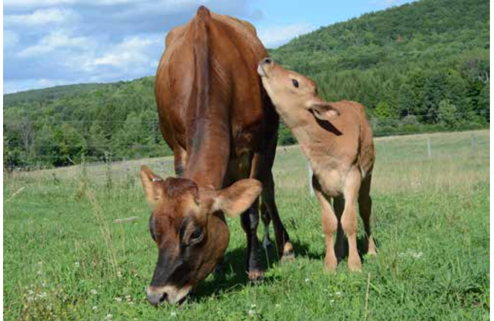
Mother Liz and her calf Cashew are bonding.

Fierce motherly love is a trait widely shared among cow moms. 65