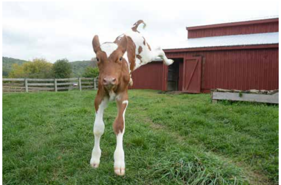
Gary the calf playing in the fields of Farm Sanctuary's New York Shelter.

a young age, cows have a strong desire for companionship, and calves especially appreciate unrestricted physical contact with others. 50 What's more, dairy calves raised in diverse, complex social groups tend to be better at coping with change, a finding that suggests an important connection between sociality and the development of cows' emotional and behavioral flexibility. 51 The calm that cows experience from the presence of friends and family members testifies to their strong social bonds and how important it is for their well-being that they live together, not apart.