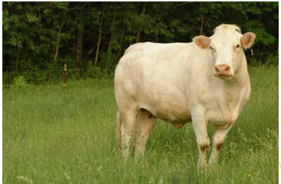
Cincinnati Freedom

Before she was called Cincinnati Freedom, people referred to her as the product she was to become: beef. In February 2002, this determined, all-white cow showed the world the force of her personality when she leapt a six-foot fence to escape the slaughterhouse that confined her. For 11 days, Cinci Freedom evaded her pursuers in the streets of Cincinnati, OH. Following her recapture, Cinci was eventually moved by a set of caring humans to farm animal paradise Farm Sanctuary in Watkins Glen, NY. As inspiring as it was, Cinci's flight from slaughter comprises only one part of her story.