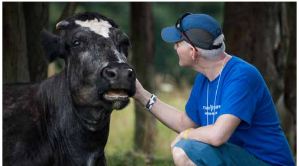
Stella the cow with a Farm Sanctuary visitor.

Cows, too, have mental concepts, and can distinguish between objects according to geometric shape, size, color, and brightness. 13 Their ability to tell one object from another is not limited to just shapes, however: Interestingly, cows can also tell the difference between individual humans. Both calves and adult cows can learn to fear humans who have previously handled them roughly. 14 Cows can even differentiate between two humans wearing the same clothes, an indication of their ability to use a range of sensory cues to tell items apart. In one study, researchers taught cows to press their noses to the right wrist of a handler to receive a tasty snack. Then, only one of the two handlers in the study provided the cows with the food prize they expected to receive. Even though the two handlers (the one who gave food and the one who did not) wore the same clothes, the cows learned to approach the snack-providing handler more often than the handler who provided no food. 15 In this instance, cows demonstrated associative learning — their understanding of the relationship between a behavior