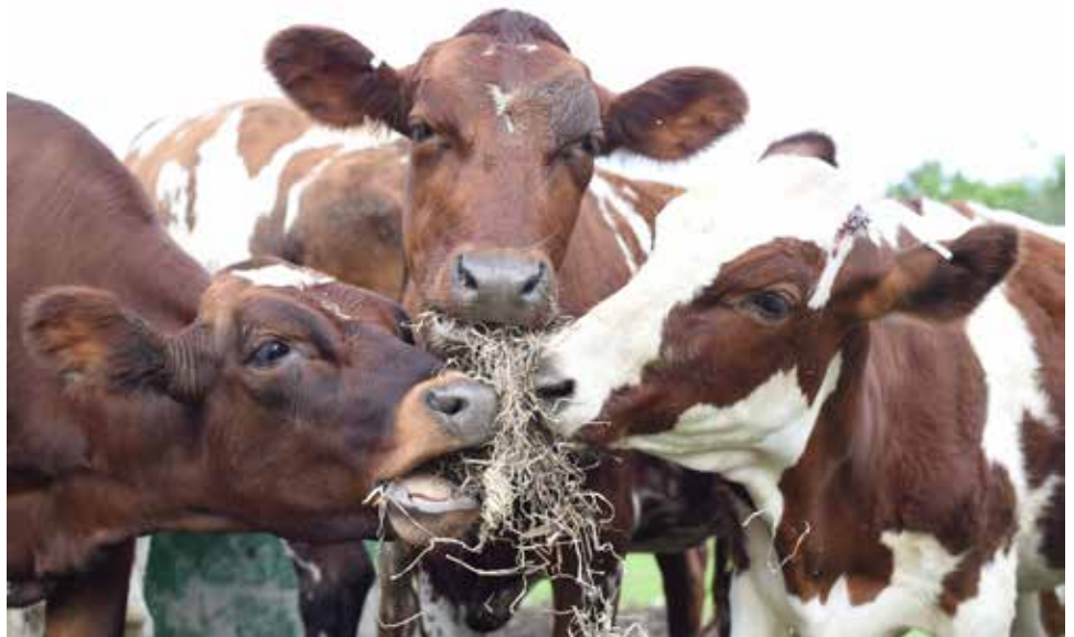
Residents at Farm Sanctuary's New York Shelter grab a bite to eat.

When lunchtime arrives, cows love salty and sweet foods, and they make use of their approximately 20,000 taste buds (about double the number that humans possess) to savor every mouthful. Cows require salty and sweet foods to get the calories and electrolyte balance they need to stay healthy. Cows enjoy salty snacks so much that they often use their sense of smell to sniff out foods with higher levels of sodium. 2